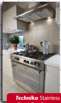
Technika Stainless Steel Gas Range