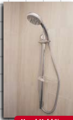
Hand Held Showers