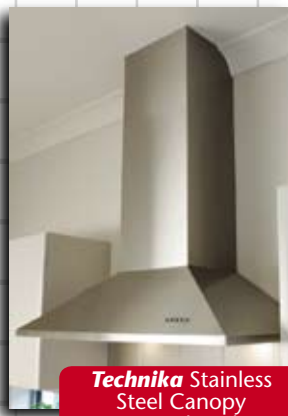
Technika Stainless Steel Canopy Rangehood