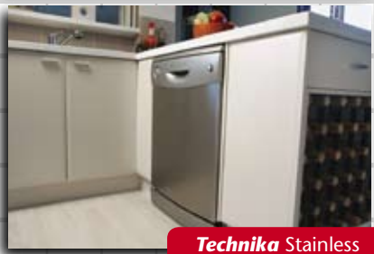
Technika Stainless Steel Dishwasher