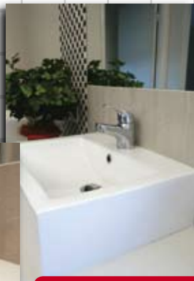
Ceramic Vanity Basins