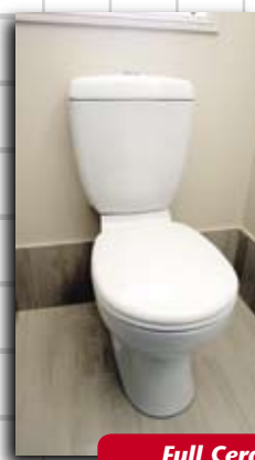
Full Ceramic WC Suites