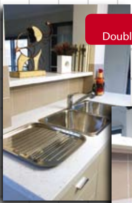
Abey Double Bowl Sink