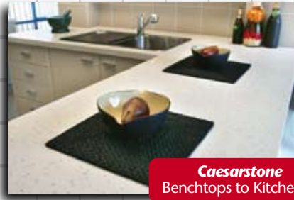
Caesarstone Benchtops to Kitchens